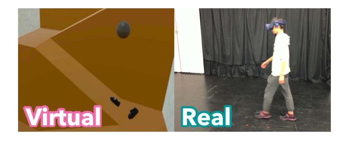
Figure 1: We investigated the sense of burden and body ownership when people are walking up (or down) virtual slopes (left) while actually walking on a flat floor in the real environment (right).

In this study, we focused on the sense of burden and body ownership using only visual stimuli by changing the step length in the VE [3]. Despite its conceptual novelty, their knowledge has plenty of room to improve the immersion and realistic feeling in the VE. To extend their knowledge is useful in the safety; to prevent an accident such that a user falls from the devices, comfort; walking freely in the VE without any constraints in RE, and ease; to be released from setting some devices. In our user study, we asked 12 participants to walk on slopes in 18 conditions by changing the gradient of the